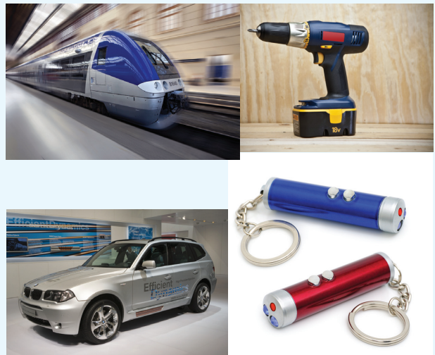
Figure TF8-2 Examples of systems that use supercapacitors.