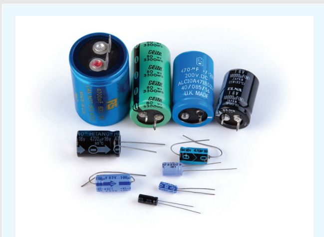
Figure TF8-1 Examples of electromechanical double-layer capacitors (EDLC), otherwise known as a supercapacitor.

For the purposes of this Technology Brief, we refer to this relatively new device as a supercapacitor: The battery is far superior to the traditional capacitor with regard to energy storage, but a capacitor can be charged and discharged much more rapidly than a battery. As a hybrid technology, the supercapacitor offers features that are intermediate between those of the battery and the traditional capacitor. The supercapacitor is now used to support a wide range of applications, from motor startups in large engines (trucks, locomotives, submarines, etc.) to flash lights in digital cameras, and its use is rapidly extending into consumer electronics (cell phones, MP3 players, laptop computers) and electric cars (Fig. TF8-2).